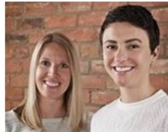
Gild Collective Building Mentorship Skills and Your Personal Board of Advisors October 17, 2019